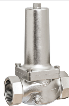
DRV 702 • DRV 708 Type B (DN 40 - DN 50)