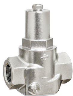
DRV 702 • DRV 708 Type A (DN 15 - DN 32)